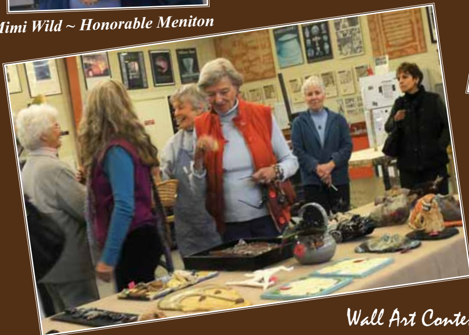
Wall Art Contest